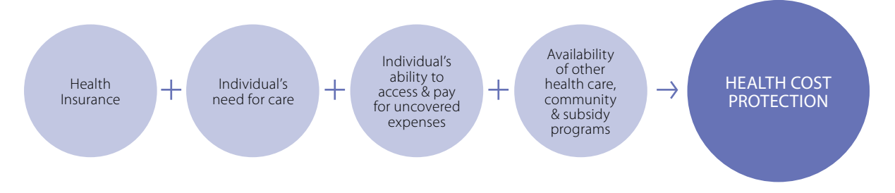
Figure 1. Determining Adequate Coverage

As the figure below shows, health insurance is just one of several factors that determine whether a particular individual has adequate protection. People's need for care, ability to access and pay for uncovered services and the availability of other programs and supports (e.g., prescription drug assistance programs, school-based health centers, public health programs, free health screenings) influence how adequate a health plan will be for a particular person. Assume, for example, that a low-income family with generally healthy children has employer-sponsored health insurance. If the family lives in a community where there are easily accessible, free or low-cost health care services, they may find they have adequate coverage for their children. But if this is not the case, then the out-of-pocket cost even for routine care may be such that the family has to delay, forgo or incur medical debt for their children's care in order to cover the costs of deductibles and copayments. In this case, their coverage is not adequate to meet their needs.